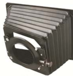
3200 Wide Angle Filter Holder 75mm 3300 Wide Angle Filter Holder 100mm