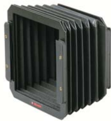
3205 Bellow Filter Holder Combination 75mm 3305 Bellow Filter Holder Combination 100mm