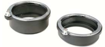
C0102 Bayonet Ring extension 15mm C0104 Bayonet Ring extension 30mm

These bayonet rings extend the bellow range of 15mm and 30mm respectively. They are used to get closer to the subject when the extension of the Flexicam or the Flexi Bellows are not sufficient.