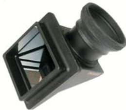
7050K66 Reflex viewfinder