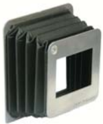
F140 Easy bellow