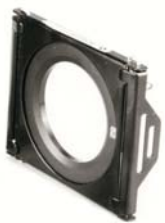
3300 Wide Angle Filter Holder 100x100mm